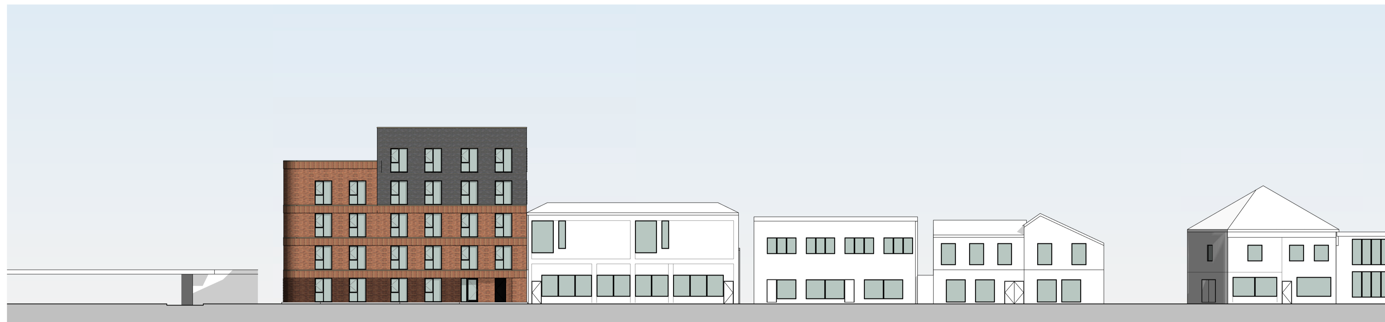
Street Scene_N Scale @ 1 : 200