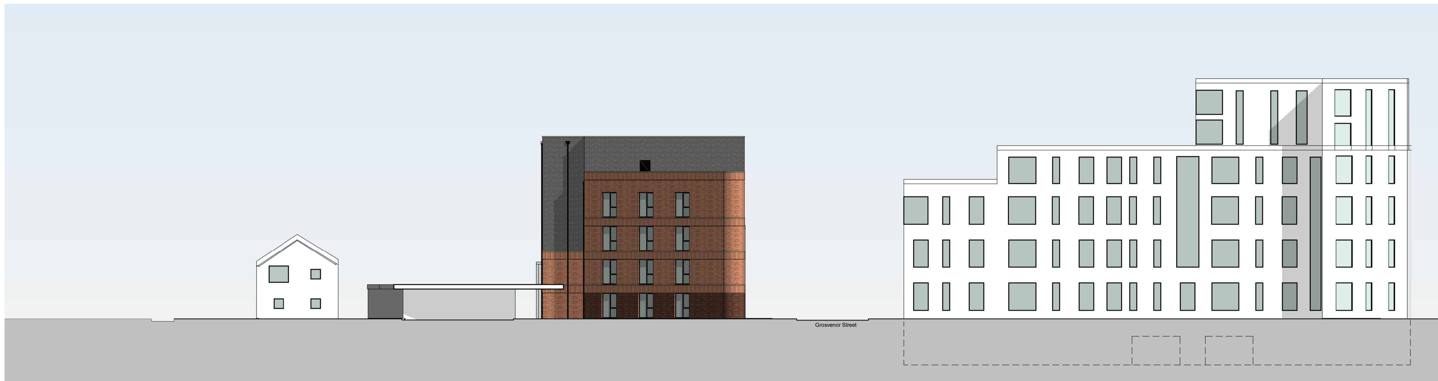
Street Scene_E Scale @ 1 : 200